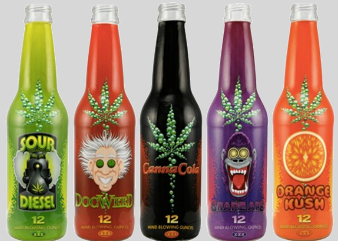
THC-infused sodas currently on the market as of February 2017.