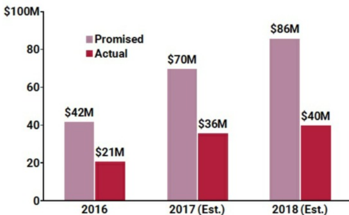
Marijuana tax money for prevention & education, WA